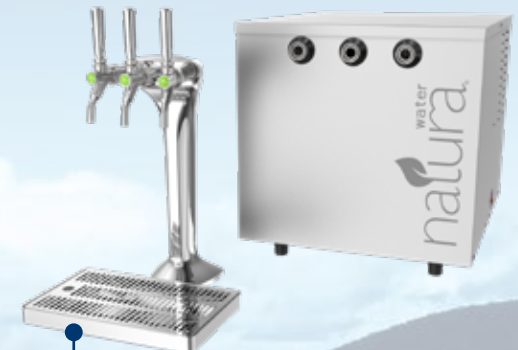
1.80 Under Counter Chiller with 3 Tap Tower Delivers 80 Liters/hour