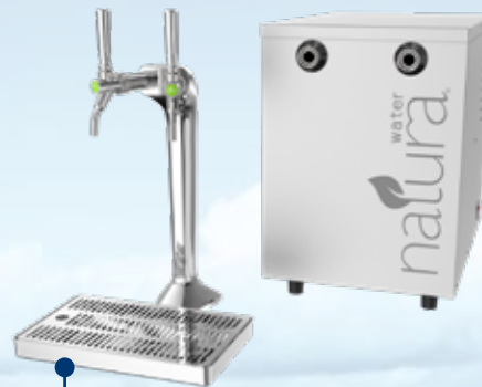
1.35 Under Counter Chiller with 2 Tap Tower Delivers 35 Liters/hour