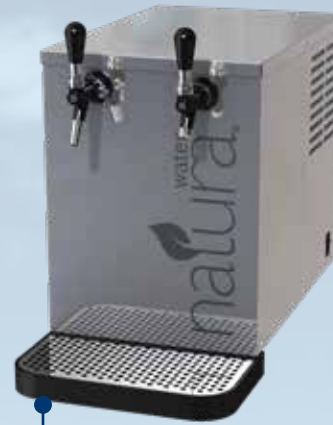
Counter Top B4 1.35 Delivers 35 Liters/hour

NATURA WATER'S four systems support SUSTAINABILITY initiatives by providing a PURE, FILTERED WATER source on demand.