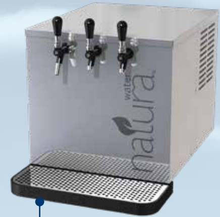
Counter Top D4 1.80 Delivers 80 Liters/hour