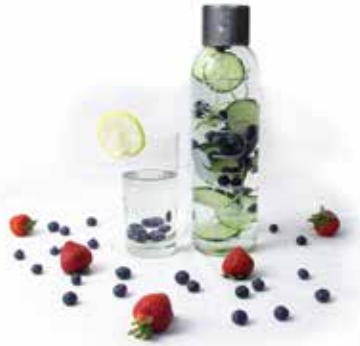
750ML REUSABLE GLASS BOTTLES

NATURA WATER'S reusable glass bottles ELIMINATE packaging waste associated with single-use plastic bottles.